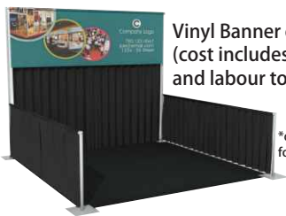
Vinyl Banner on drape (cost includes banner, installation hardware and labour to install)

*draped booth & carpet are shown for example purposes only.